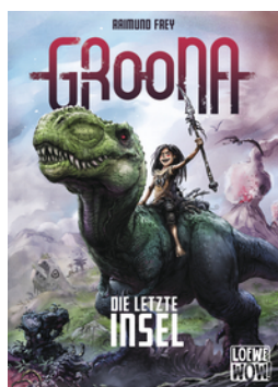
Groona – The Last Island (Vol. 1)