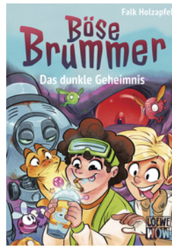
Bad Bugs - Dark Secret (Vol.2)