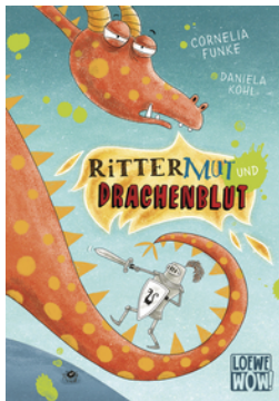
Knighthood and Dragon's Blood