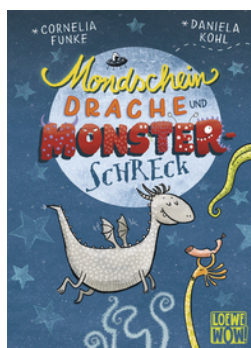
Moonshine Dragon and Monster Shock