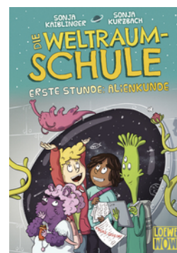
Space School – Science of Aliens (Vol. 1)