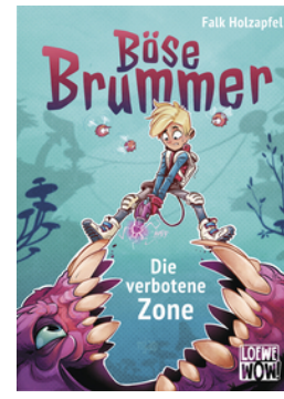
Bad Bugs - The Forbidden Zone (Vol.1)