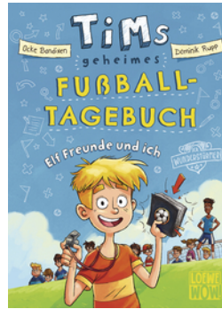
Tim's Secret Soccer Diary – 11 Friends and I (Vol.1)