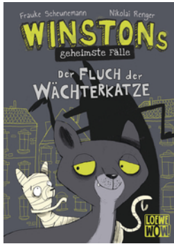
WINSTON's Cold Cases – The Curse of the Watch Cat (Vol. 1)