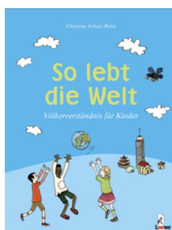
How The World Lives