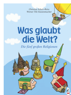
What Does The World Believe?