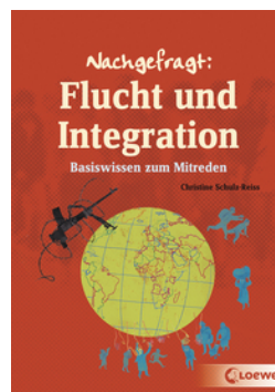
Guide to Refugee Migration and Integration