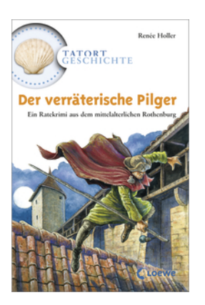
History Mysteries - The Treacherous Pilgrim