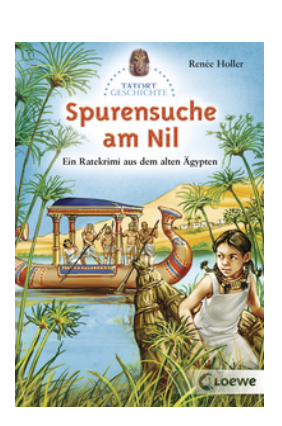
History Mysteries - Robbers on the Nile