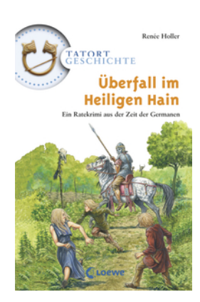
History Mysteries - Attack in the Sacred Grove