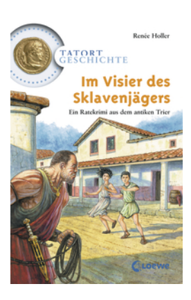
History Mysteries - Eyed by the Slave Hunter