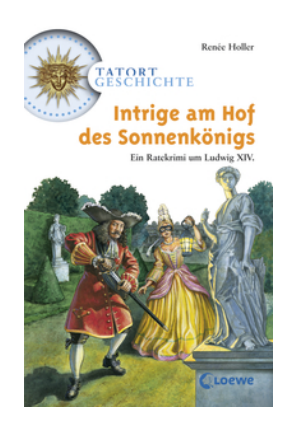
History Mysteries - Intrigue at the Sun King's Court