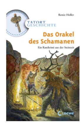
History Mysteries -The Shaman's Oracle