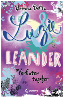
Lucie & Leander - Courageously Wicked (Vol. 6)