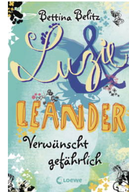
Lucie & Leander – Dangerously Accursed (Vol. 5)