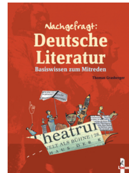
Guide to German Literature