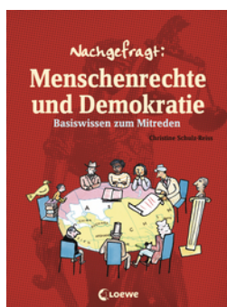
Guide to Human Rights and Democracy