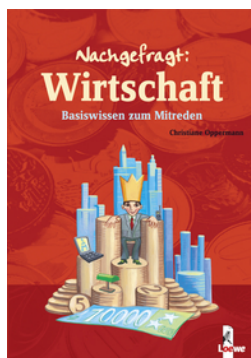
Guide to Economics