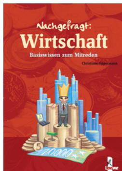
Guide to Economics