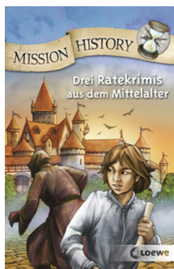
Mission History: Crime Stories in the Middle Ages