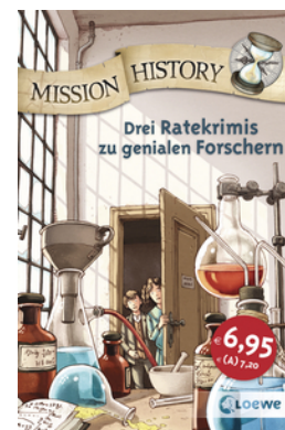
Mission History – Genius Scientists