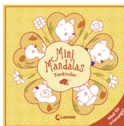
Mini Mandalas - Animal Babies