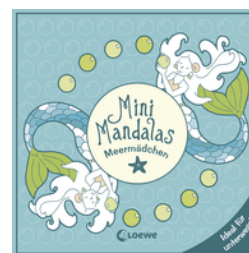
Mini Mandalas - Mermaids