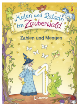
Drawing and Quiz-Solving in the Enchanted Forest - Numbers and Quantities