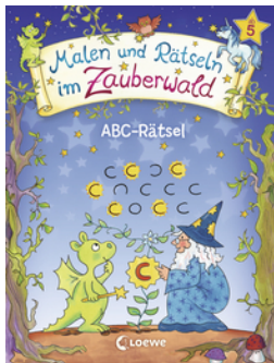
Drawing and Puzzle-solving in the Enchanted Forest - ABC-Quiz