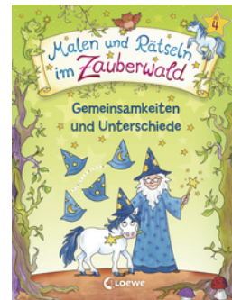
Drawing and Puzzle-solving in the Enchanted Forest - Similarities and Differences