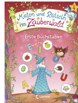
Drawing and Puzzle-solving in the Enchanted Forest - First Letters