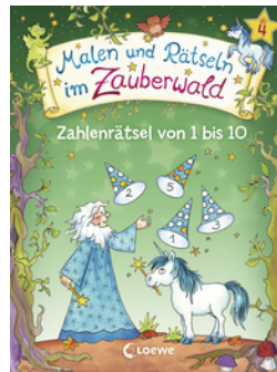
Drawing and Puzzle-solving in the Enchanted Forest - Number Puzzles from 1 to 10