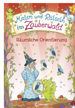
Drawing and Quiz-Solving in the Enchanted Forest - Spatial Orientation