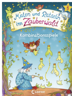
Drawing and Puzzle-solving in the Enchanted Forest - Puzzles