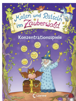
Drawing and Quiz-Solving in the Enchanted Forest - Concentration