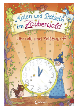
Drawing and Puzzle-solving in the Enchanted Forest - Time