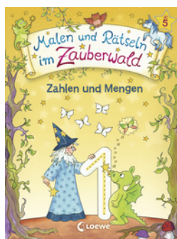
Drawing and Quiz-Solving in the Enchanted Forest - Numbers and Quantities