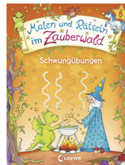
Drawing and Puzzle-Solving in the Enchanted Forest - Writing Exercises