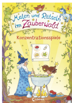
Drawing and Puzzle-solving in the Enchanted Forest - Concentration Games