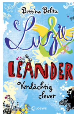
Lucy & Leander – Suspiciously Clever (Vol. 7)