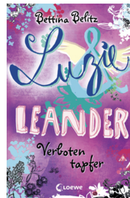
Lucie & Leander - Courageously Wicked (Vol. 6)