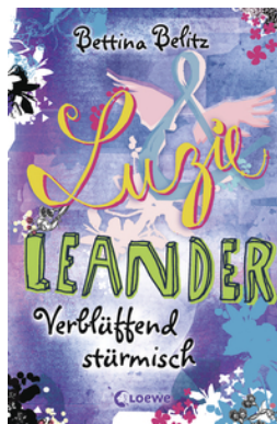
Lucie and Leander – Stunningly Stormy (Vol. 4)