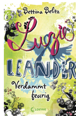
Lucie and Leander – Fierily Damned (Vol. 2)