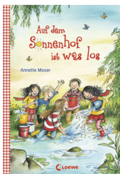
Sunny Farm – Something's up on Sunny Farm (Vol. 3)