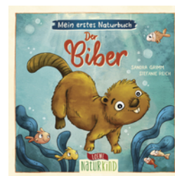
My First Naturebook – The Beaver