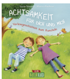
Attentiveness for All of Us! – Story Time is Cuddle Time!