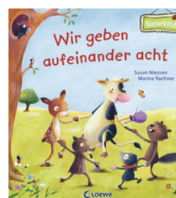
We care for each other!