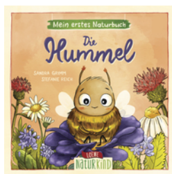
My First Naturebook – The Bumblebee