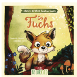
My First Naturebook – The Fox