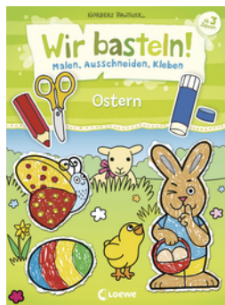
Let's Do Arts and Crafts! - Easter