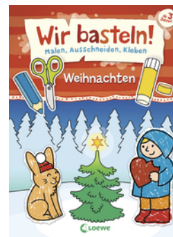
Let's Do Arts & Crafts! - Christmas