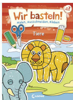
Let's Do Arts and Crafts! - Animals