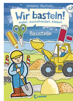
Let's Do Arts and Crafts! - Construction Site