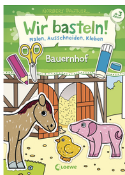
Let's Do Arts and Crafts! - Farm