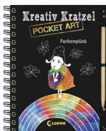
Creative Scratch Pocket Art: A Rainbow of Colour