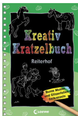
Creative Scratch Book - Riding School