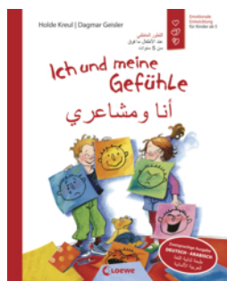
Safe Child, Happy Parent – Me and My Feelings (German - Arabic) - Bilingual Edition