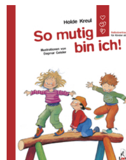
I Can Be Brave - Overcoming Fear, Finding Confidence, and Asserting Yourself