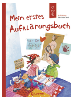
My First Book of Sexual Education