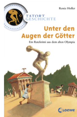
History Mysteries - Under the Eyes of the Gods