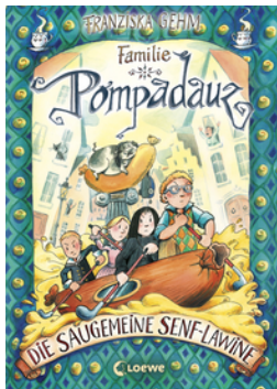
Meet the Pompadauz - The Pig-Awful Mustard Landslide (Vol. 4)