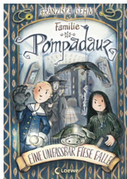
Meet the Pompadauz - An Incredibly Nasty Trap (Vol. 2)