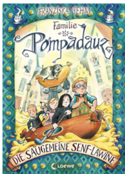
Meet the Pompadauz - The Pig-Awful Mustard Landslide (Vol. 4)