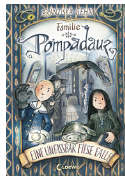
Meet the Pompadauz - An Incredibly Nasty Trap (Vol. 2)