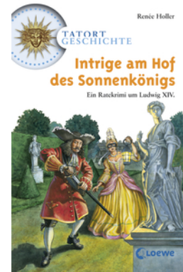
History Mysteries - Intrigue at the Sun King's Court