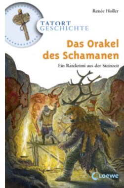
History Mysteries - The Shaman's Oracle