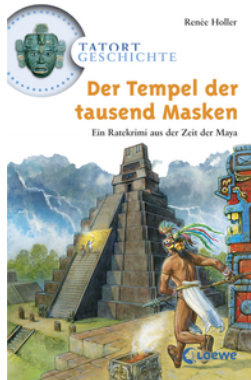
History Mysteries - The Temple of Thousand Masks