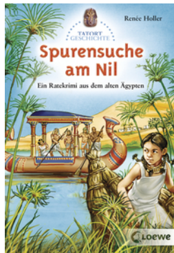
History Mysteries - Robbers on the Nile