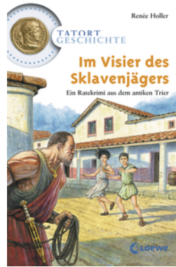
History Mysteries - Eyed by the Slave Hunter