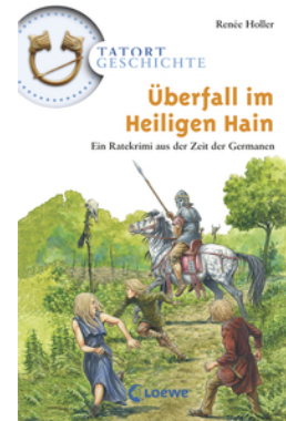
History Mysteries - Attack in the Sacred Grove