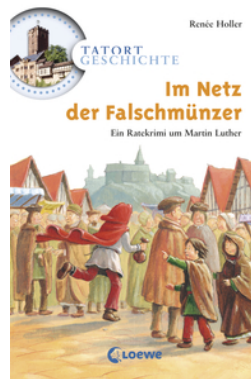
History Mysteries - Caught in the Forger's Web