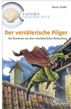
History Mysteries - The Treacherous Pilgrim