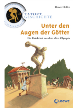
History Mysteries - Under the Eyes of the Gods