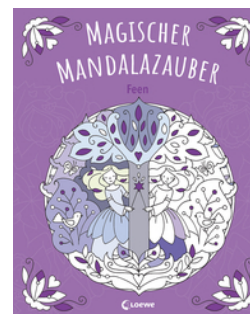
Enchanting Mandala Magic – Fairies