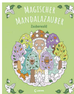
Enchanting Mandala Magic – Magical Forest