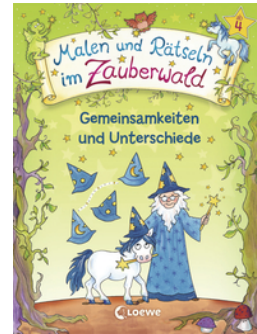
Drawing and Puzzle-solving in the Enchanted Forest - Similarities and Differences