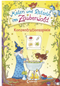
Drawing and Puzzle-solving in the Enchanted Forest - Concentration Games