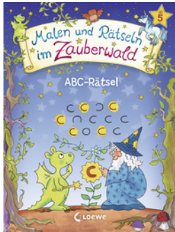
Drawing and Puzzle-solving in the Enchanted Forest - ABC-Quiz