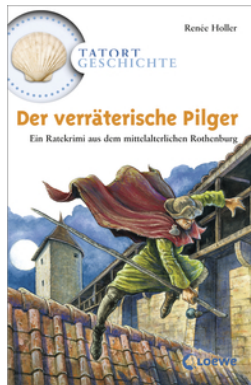
History Mysteries - The Treacherous Pilgrim