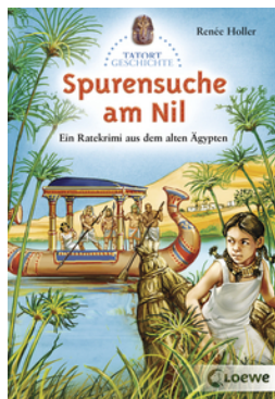
History Mysteries - Robbers on the Nile