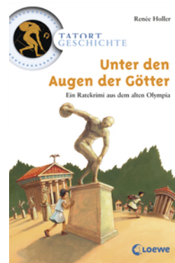
History Mysteries - Under the Eyes of the Gods