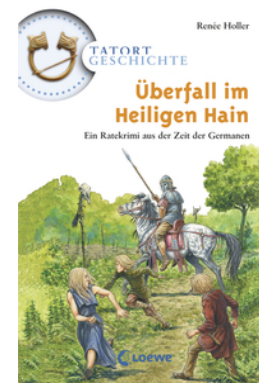
History Mysteries - Attack in the Sacred Grove