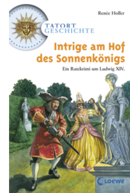
History Mysteries - Intrigue at the Sun King's Court