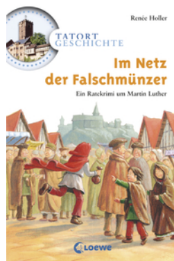
History Mysteries - Caught in the Forger's Web