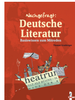
Guide to German Literature