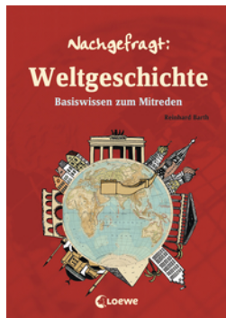
Guide to World History