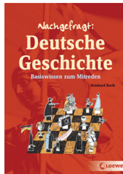
Guide to German History