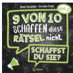
9 out of 10 Can't Solve These Puzzles (Vol. 2)