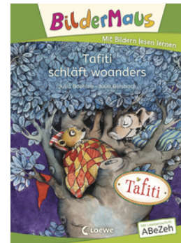
Picture Mouse - Tafiti Sleeps Somewhere Else