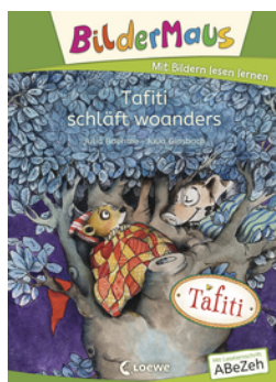
Picture Mouse - Tafiti Sleeps Somewhere Else