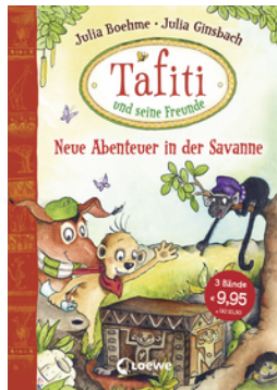
Tafiti and His Friends - New Adventures in the Savannah (Vol. 4-6)