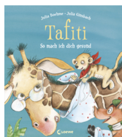
Tafiti – That’s How You Get Well