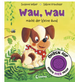
The Dog Says "Woof Woof"