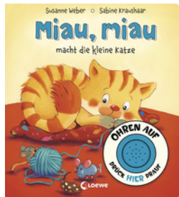
The Cat Says "Meow Meow"