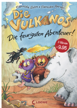
The Vulkanos – Their Most Explosive Adventures