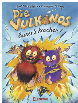
The Vulkanos Let It Rip! (Vol. 3)