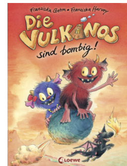
The Vulkanos Are Smashing! (Vol. 2)