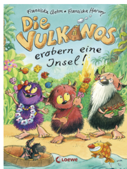
The Vulkanos Conquer an Island (Vol. 7)