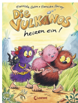
The Vulkanos Fire Up! (Vol. 6)