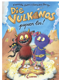
The Vulkanos Fart Away! (Vol. 1)