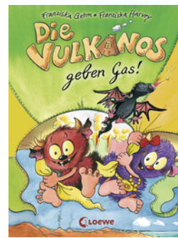
The Vulkanos Give it Some Gas! (Vol. 5)