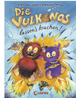
The Vulkanos Let It Rip! (Vol. 3)