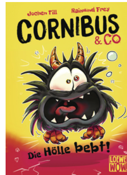
Cornibus & Co. - Hell Quakes (Vol. 3)