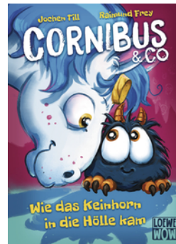
Cornibus & Co. - How the No-Unicorn Came to Hell (Vol. 4)