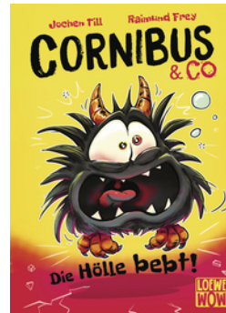
Cornibus & Co. - Hell Quakes (Vol. 3)