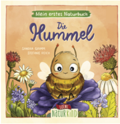
My First Naturebook – The Bumblebee