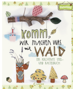
Let's Make Something with Wood