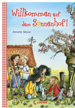
Sunny Farm – Welcome to Sunny Farm! (Vol. 1)