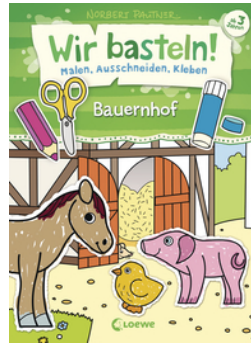
Let's Do Arts and Crafts! - Farm