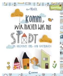
Let's Make Something in Town