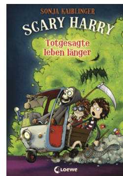
Scary Harry – The Reported Dead Live Longer (Vol. 2)