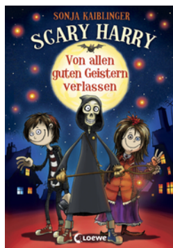
Scary Harry – Takes Leave of his Senses (Vol. 1)