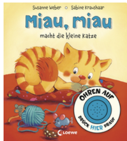
The Cat Says "Meow Meow"