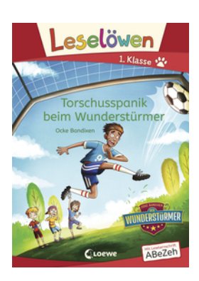
Ace Striker in Goal-Scoring Panic