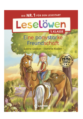
Reading Lions (Year 1) - A Pony-Strong Friendship