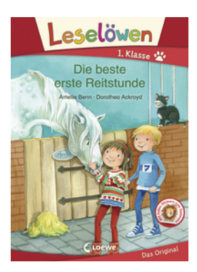
The Best First Riding Lesson