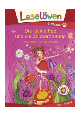
The Little Fairy and the Magic Exam