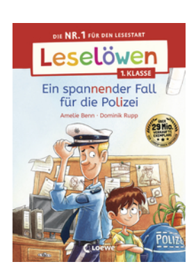
Reading Lions (Year 1) - An Exciting Case for the Police