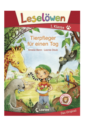
Zoo Keeper for a Day