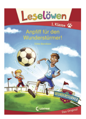
Reading Lions Year 1 - Kick-off for the Ace Striker!