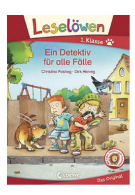
A Detective for All Cases