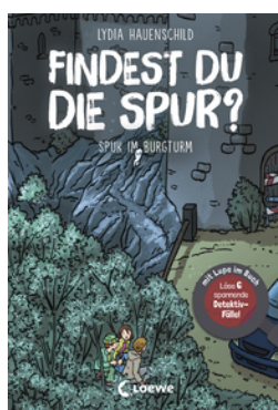
Can You Find the Clue? - Haunting the Castle Tower