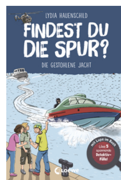
Can You Find the Clue? - The Stolen Yacht