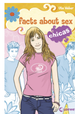
Facts About Sex - Chicas