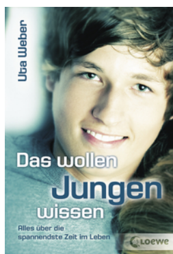
All Boys Want to Know – Facts about the Most Exciting Time of Life