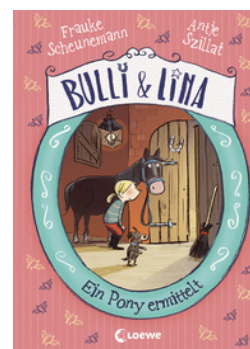
Bulli & Lina - A Pony Investigates (Vol. 4)