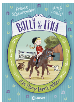
Bulli and Lina - A Pony Learns to Ride (Vol. 2)