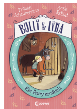
Bulli & Lina - A Pony Investigates (Vol. 4)