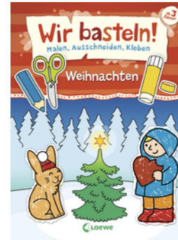
Let's Do Arts & Crafts! - Christmas