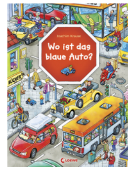
Can You Find the Blue Car?