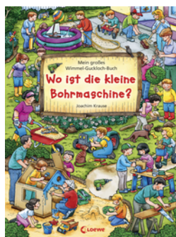
Where Is ... The Little Drill?