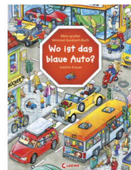
Where Is ... The Blue Car?