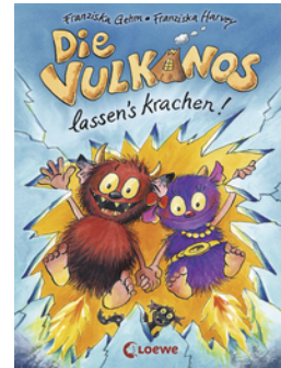
The Vulkanos Let It Rip! (Vol. 3)