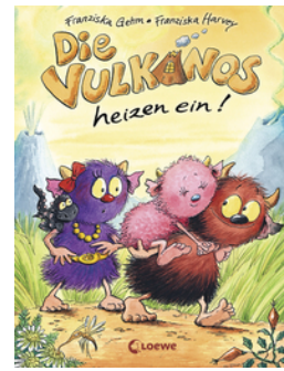
The Vulkanos Fire Up! (Vol. 6)