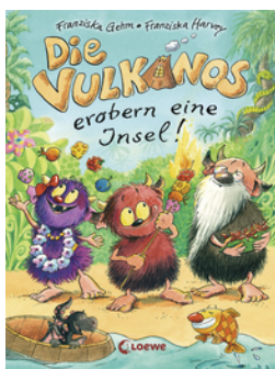
The Vulkanos Conquer an Island (Vol. 7)