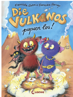
The Vulkanos Fart Away! (Vol. 1)