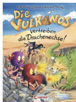
The Vulkanos Chase Away the Dragon Lizard! (Vol.8)