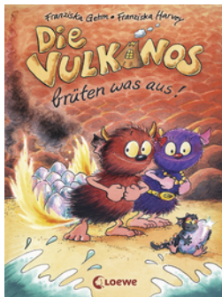
The Vulkanos Hatch A Plan! (Vol. 4)