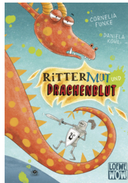
Knighthood and Dragon's Blood